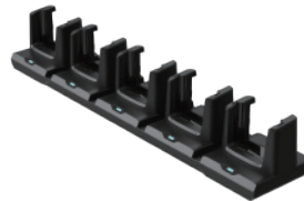
5-Slot Cradle Charger